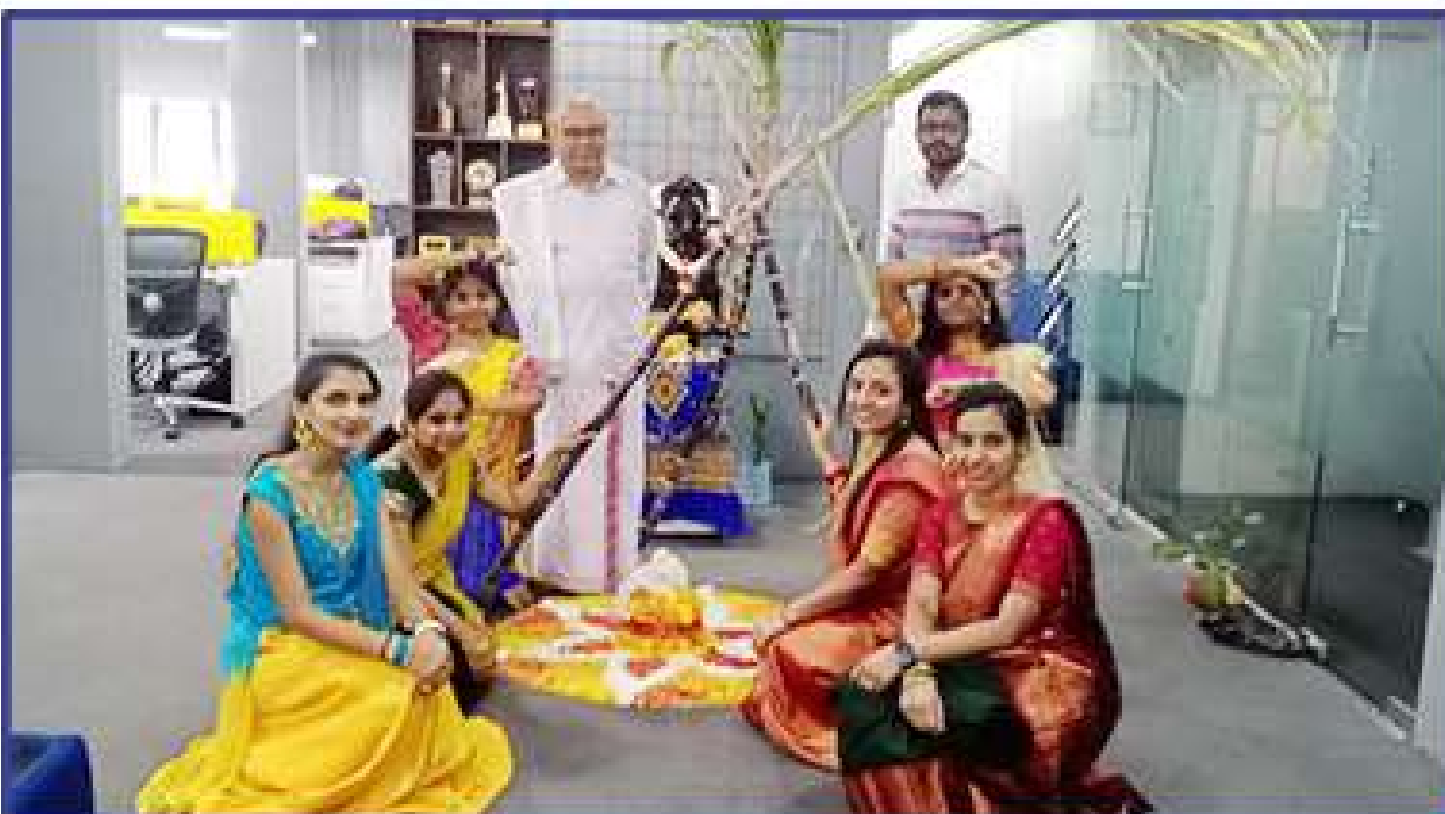
Unique Team Photography