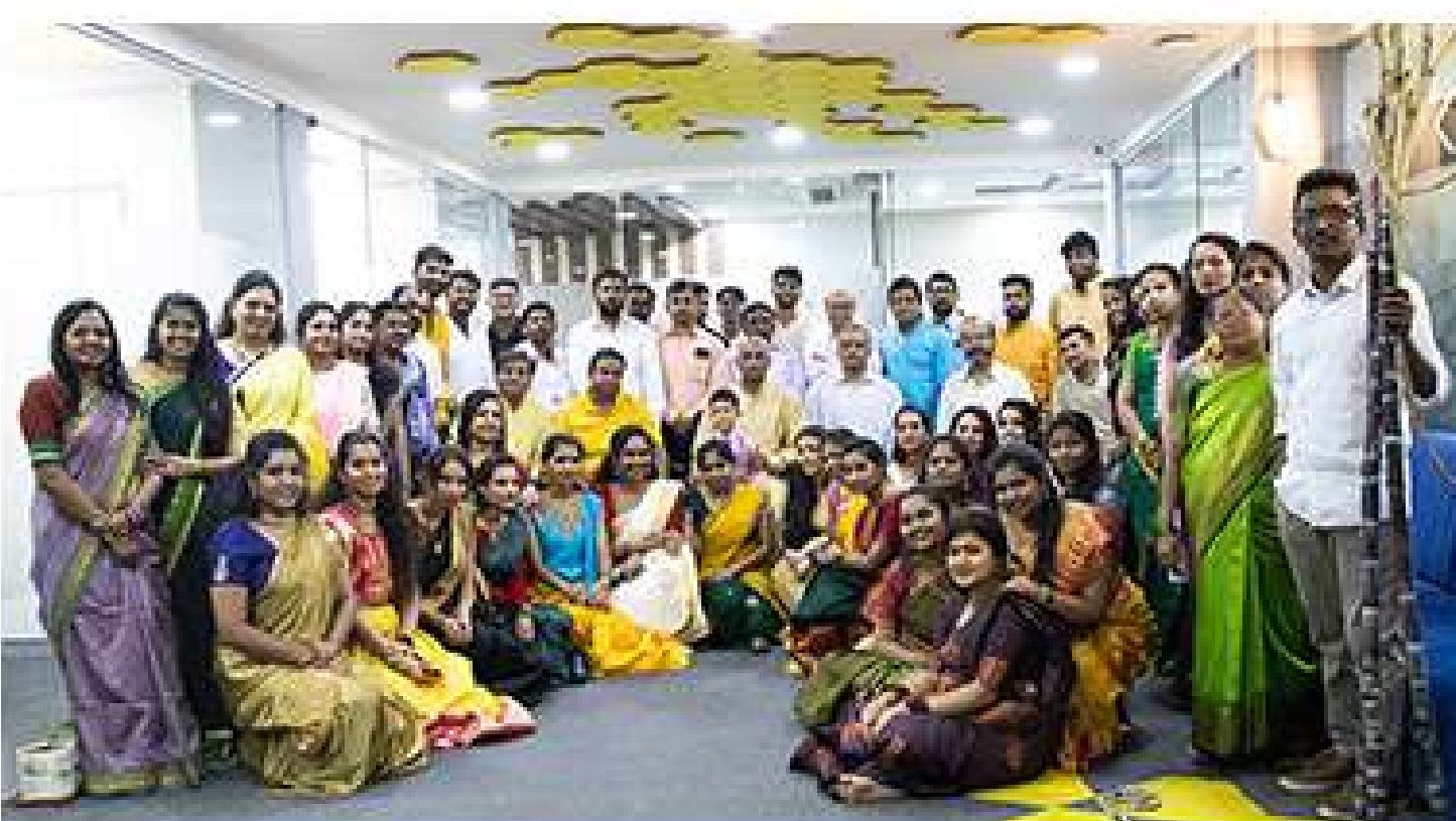
Cadmaxx team at sankranti celebration